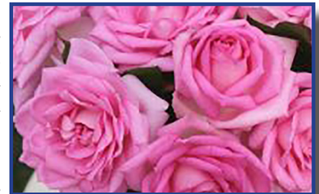
Hybrid Tea Rose

Red-Blooming Plants - The holiday season is over but, if you like to add some red-blooming plants