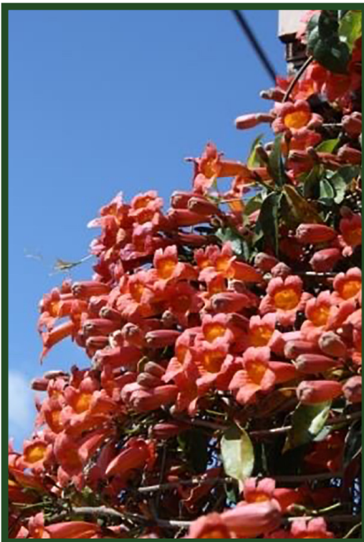
Tangerine Beauty Crossvine