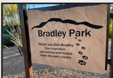
Bradley Park - page 2