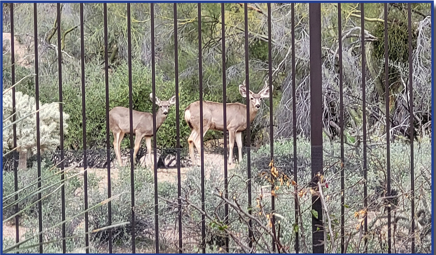
Two of 4 deer spotted in the natural area on Pasaro on March 11, 2023.

1. Total Renovation and Upgrade to our two Tennis/Pickleball Courts. The current state of our existing courts is unsatisfactory. They are continually in need of repairs as the subsurface base of the courts is settling and surface deterioration and cracking is a recurring problem. This summer we will be filling and sealing all of the existing playing surface cracks and restriping the East tennis court to allow for pickleball play. A more permanent solution is needed. This coming year the Board will be studying and reviewing alternatives for a solution which will involve a major reconstruction of the courts and replacement of the playing surfaces. Any such project will probably not be scheduled until sometime after the start of the 2024-25 fiscal year, beginning on July 1, 2024.